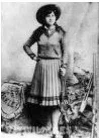
figure of the American Old West.

Annie Oakley- Born in a log cabin on the Ohio frontier, Annie Oakley began shooting game at age nine to support her widowed mother and siblings. Whether it be a pistol, rifle, or shotgun, the legendary markswoman Annie Oakley was masterful with them all. Dubbed "Little Sure Shot" by Chief Sitting Bull (she was 5 feet tall), her sharp shooting in Buffalo Bill's Wild West Show won her many awards and captivated audiences far and wide. Her name remains synonymous with firearms and entertainment. For seventeen years Annie Oakley was the Wild West Show's star attraction with her marvelous shooting feats. At 90 feet Annie could shoot a dime tossed in midair. In one day with a .22 rifle she shot 4,472 of 5,000 glass balls tossed in midair. Annie Oakley died of pernicious anemia on Nov. 3, 1926, in Greenville, Ohio, at the age of sixty-six. A legend in her own time, the remarkable life of Annie Oakley would be celebrated in the 1946 Herbert and Dorothy Fields musical Annie Get Your Gun .